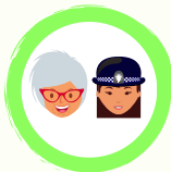
An adult you trust